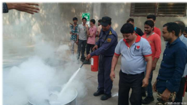
Guards' participation in fire fighting exercise at client site