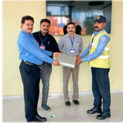
Gift Ceremony for Excellent Performance at KICT Terminal, Kandla