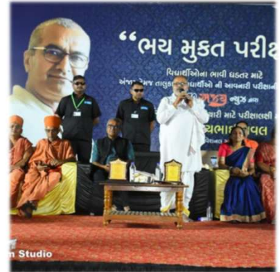
Educational Event at Anjar, Gandhidham