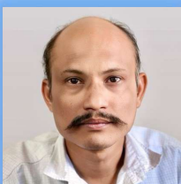
ASTOM BURMAN G'DHAM OFFICE ADMINISTRATION