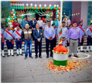
Republic Day Celebration