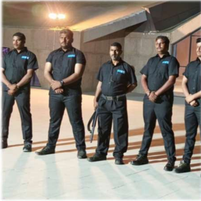
New Year Event