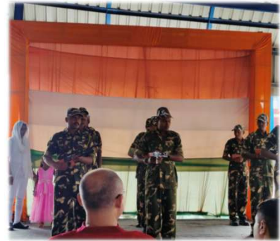
Guards' participation at client's event